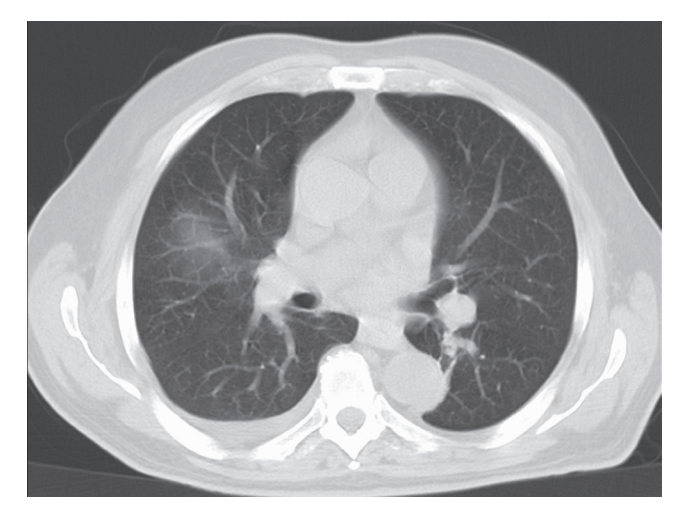
FIGURE 1. A chest computerized tomography shows a small right sided pleural effusion.

A 72 years-old man was admitted for fever during the last two days. The patient was febrile with a temperature of 39°C. Chest auscultation revealed end-inspiratory crackles over the right lung base. Laboratory testing was remarkable for mild leukocytosis. A chest radiograph and computerized tomography (Fig. 1) showed small right sided pleural effusion, with no findings for pulmonary embolism. The patient was treated as community acquired pneumonia. In spite of antibiotic therapy the fever remained stable. A suspicion for subdiaphragmatic cause of pleural effusion was raised in differential thought. The patient underwent an abdomen computerized tomography (Fig. 2) which revealed findings compatible to a large liver abscess. The patient was transferred to a tertiary hospital. An amoebic liver abscess was diagnosed treated with anti-amoebic therapy with complete resolution.